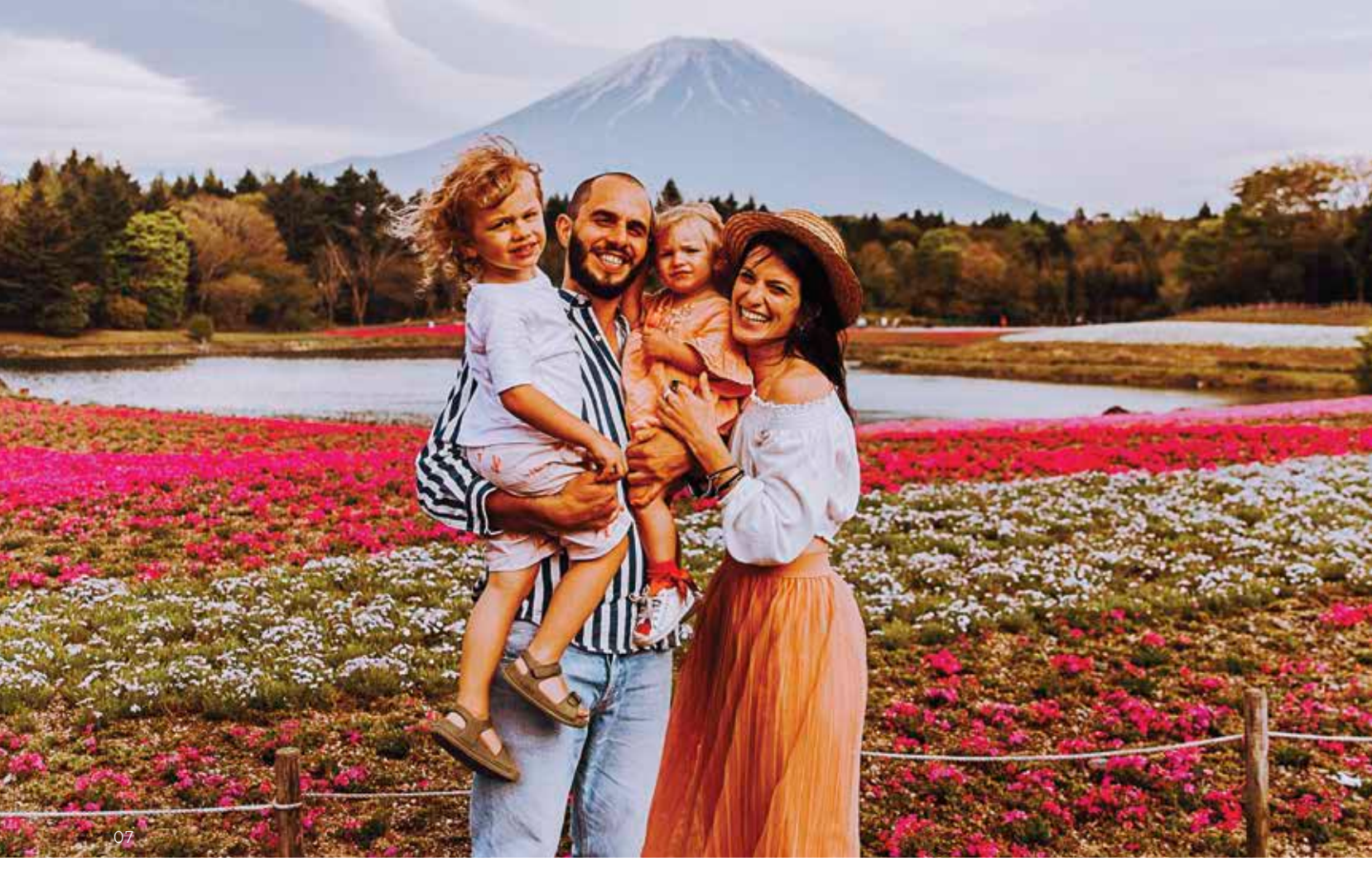
05 Snow monkeys hang out in onsen hot springs 06 Fushimi Inari-taisha is famous for its thousands of torii gates 07 Flowers at the base of Mount Fuji make for an idyllic backdrop to a family portrait