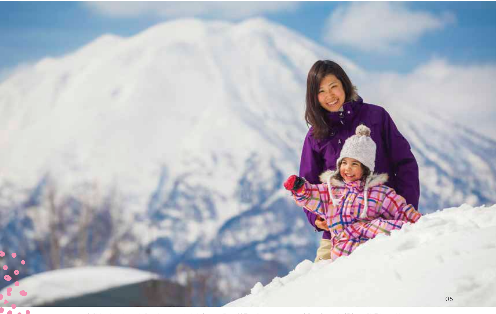
01 Rich colours feature in Japan's summer festivals © cowardlion 02 The vibrant tones of koyo © Fang ChunKai 03 Senso-ji is Tokyo's oldest temple © IM_photo 04 Playing in the white powder 05 Mum and daughter enjoy the pristine snow. Images 04 & 05 © SkiJapan.com. Images 01–03 © Shutterstock.com

the popular destination, or head to Yatsugatake Heights in Nagano for a breathtaking combination of wild, rocky ranges and abundant forest land.