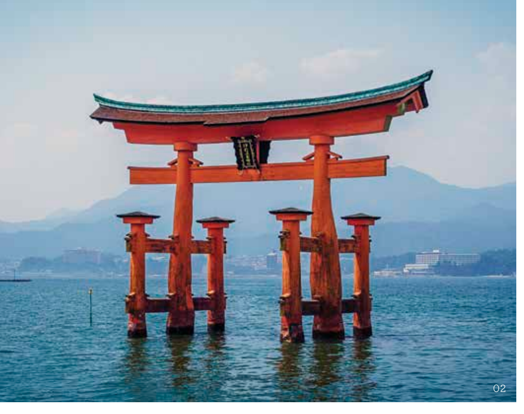
01 Plenty of tasty treats in colourful Osaka 02 The torii gate appears to float at Itsukushima Shrine 03 Shinjuku is one of 23 city wards in Tokyo 04 The bamboo forest of Arashiyama is home of the Togetsukyo Bridge