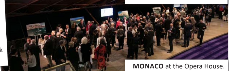
MONACO at the Opera House.