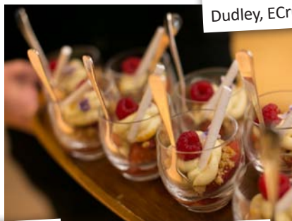
GUESTS were treated to these delicious desserts.