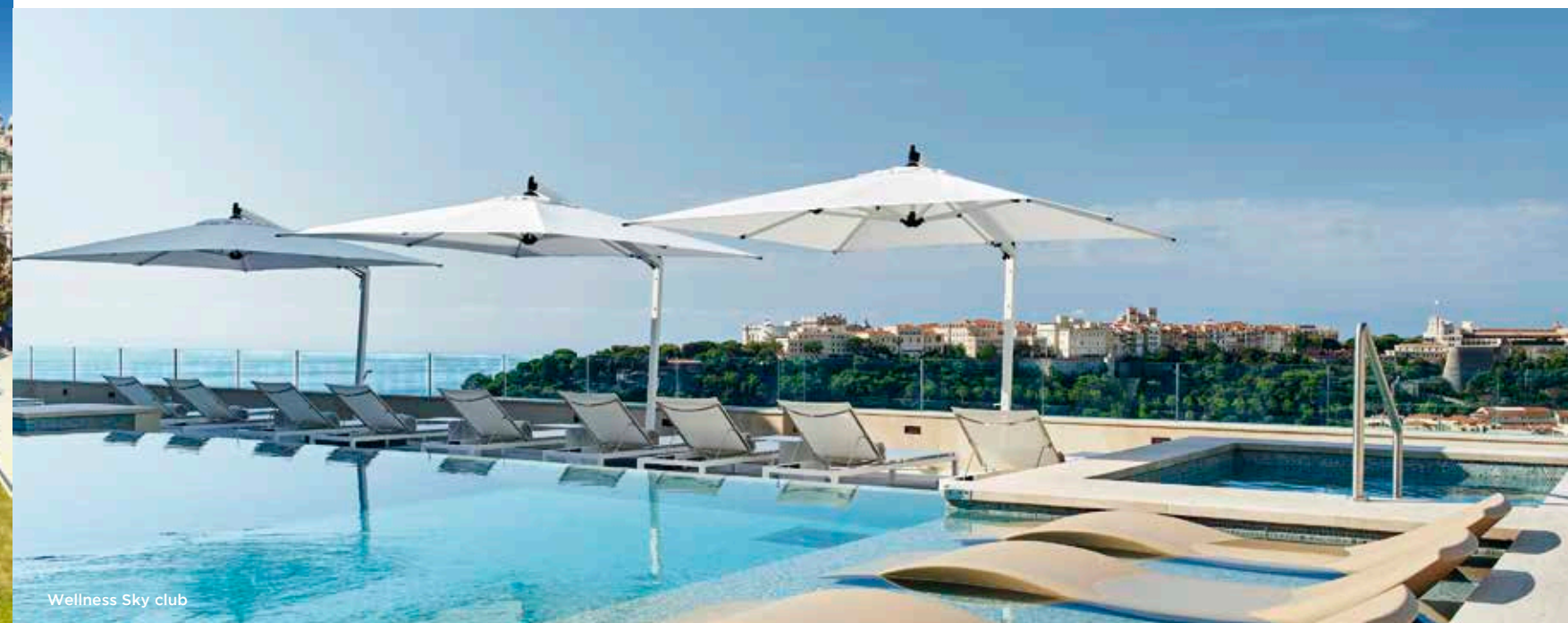
Wellness Sky club