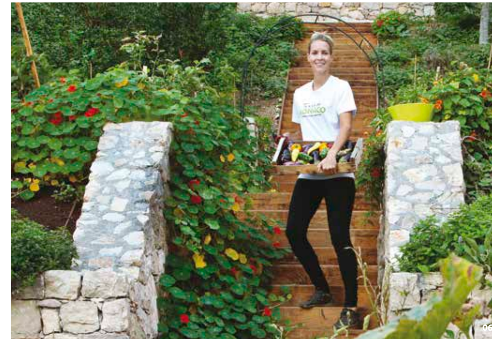
01 Diamond Suite Princess Grace at Hôtel de Paris Monte-Carlo 02 Hôtel de Paris gardens 03 Elsa is the world's only organic, eco-certified Michelin-starred restaurant 04 An opulent bathroom at Hôtel de Paris 05 A suite at the same hotel 06 Terre de Monaco is responsible for many of the urban gardens 01-06 © Monte-Carlo SBM