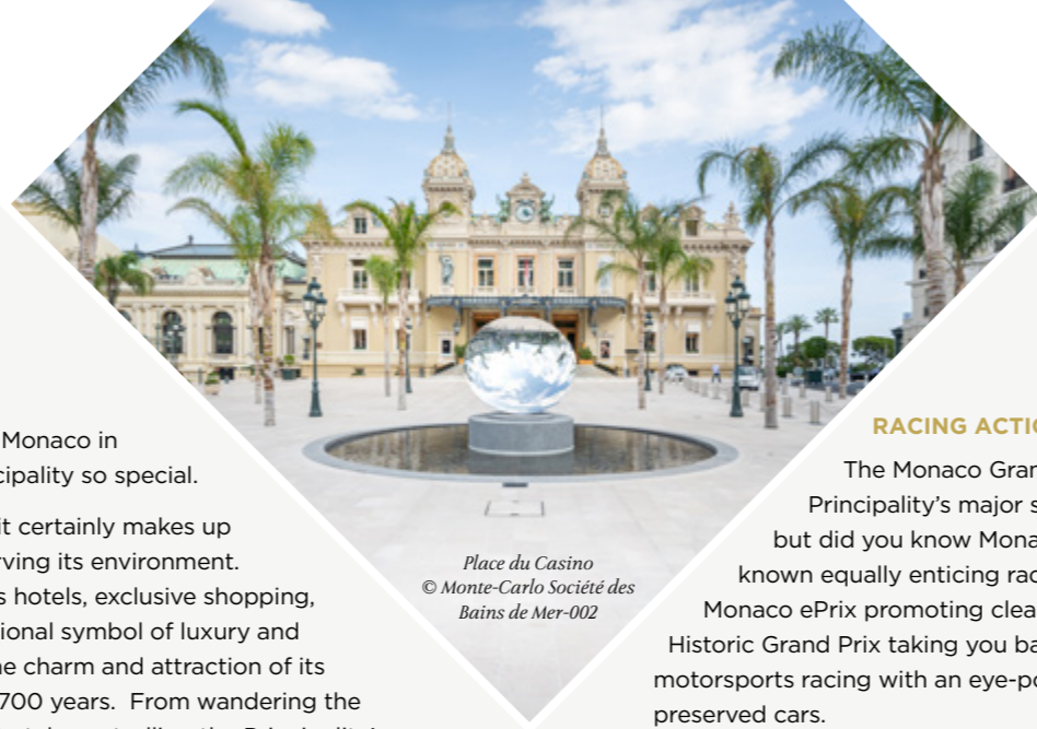
Place du Casino

Whilst Monaco is dearly missing its Australian visitors, Australia is currently more present than ever thanks to the Oceanographic Museum of Monaco who are hosting an interactive exhibition, dedicated to the magnificence of the Great Barrier Reef. The unique exhibition, "IMMERSION" reveals one of the seven natural wonders of the world through a multimedia installation which offers visitors the opportunity to virtually experience a dive below the surface to meet the iconic species that inhabit the planet's largest coral ecosystem.