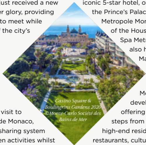
Casino Square & Boulingrins Gardens 2020