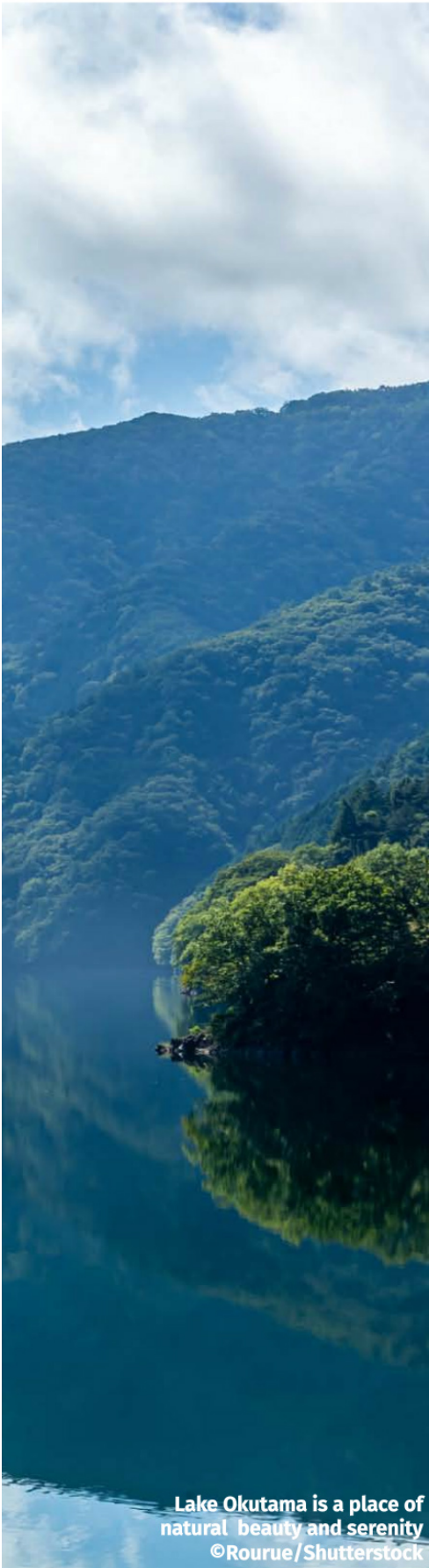
Lake Okutama is a place of natural beauty and serenity

Tranquil forests, sacred mountains, deep gorges with rushing rivers and waterfalls are not usually associated with Japan's neon capital Tokyo, but the vast Tama region covering Tokyo's Western side offers just that and much more. Okutama, Tokyo's oasis of green is just 90 minutes from the centre of the bustling city and still part of the Tokyo Prefecture.